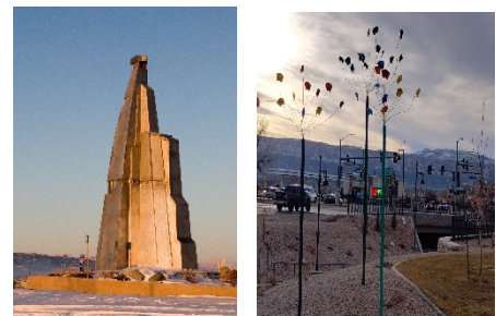
Existing I-70 & 24 Road and Canyon View Park Artwork

The artwork can reflect or represent the natural environment, water, local landscape, and scenic features, visually complimenting the Gateway installation 1 mile to the north on 24 Road and I-70 roundabouts, and/or can be very abstract, colorful, and geometric in design to complement the colorful artwork adjacent to the roundabout in Canyon View Park. The site line from the roundabout continues south and west to the Colorado National Monument, north to the Bookcliffs, and east to Mount Garfield and the Grand Mesa.