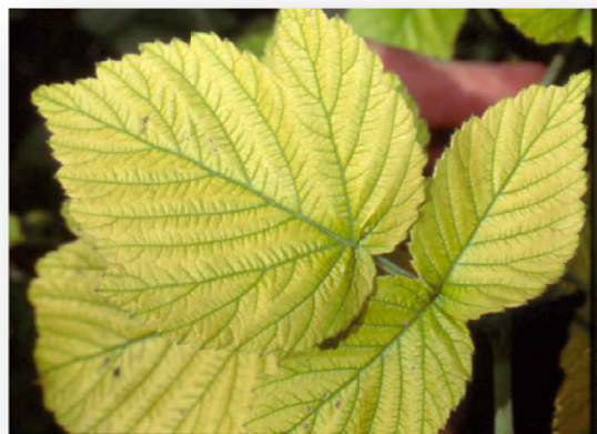
Figure 1. Symptoms of iron chlorosis include yellowing of the leaf with veins remaining green.

Iron chlorosis refers to a yellowing caused by an iron deficiency in the leaf tissues. The primary symptoms of iron deficiency include interveinal chlorosis , i.e., a general yellowing of leaves with veins remaining green . In severe cases, leaves may become pale yellow or whitish, but veins retain a greenish cast. Angular shaped brown spots may develop between veins and leaf margins may scorch (brown along the edge). [Figure 1]