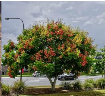
Koelreuteria paniculata Golden Rain Tree

Smaller shade tree with showy blossoms and fruits. Light: Full Sun Height: 30' – 40' Spread: 30' – 40' Type: Deciduous Growth Rate: Medium/Fast Water Demand: Xeric