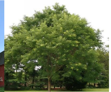
Styphnolobium japonica Japanese Pagoda Tree

Tolerates pollution and mild drought, storm damage risk. Light: Full Sun to Part Shade Height: 50' – 70' Spread: 50' – 70' Type: Deciduous Growth Rate: Medium/Fast Water Demand: Low