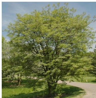
Maackia amurensis Amur Maackia

Hardy, pollinator friendly, with fragrant blossoms. Light: Full Sun Height: 20' – 30' Spread: 15' – 20' Type: Deciduous Growth Rate: Slow Water Demand: Xeric