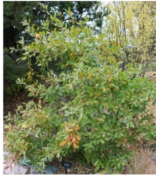
Quercus undulata Wavey Leaf Oak

Shrub-like, produces acorns, with blue-green leaves. Light: Full Sun to Part Shade Height: 10' – 20' Spread: 10' – 15' Type: Native Deciduous Growth Rate: Slow Water Demand: Xeric