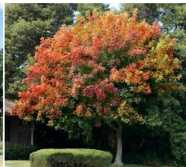
Pistacia chinensis Chinese Pistache

Drought-tolerant shade tree, successful in Southwest. Light: Full Sun Height: 30' – 35' Spread: 20' – 30' Type: Deciduous Growth Rate: Medium Water Demand: Xeric/Low