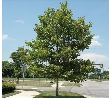
Platanus x acerifolia London Planetree

Hybrid of sycamore and planetree, tolerates heat. Light: Full Sun to Part Shade Height: 60' – 70' Spread: 40' – 50' Type: Deciduous Growth Rate: Medium/Fast Water Demand: Medium