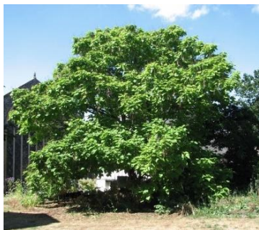
Catalpa ovata Chinese Catalpa

Tolerates poor soils and high moisture, long fruit pods. Light: Full Sun to Part Shade Height: 20' – 30' Spread: 20' – 30' Type: Deciduous Growth Rate: Medium/Fast Water Demand: Medium