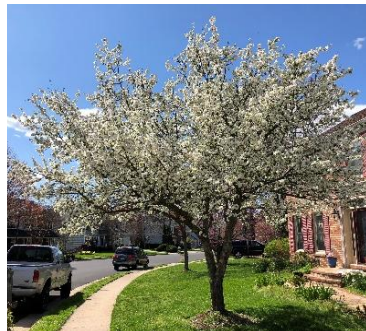
Malus spp. Crabapple

Diverse flowering trees with small fruits. Light: Full Sun to Part Shade Height: 10' – 30' Spread: 10' – 30' Type: Deciduous Growth Rate: Medium / Fast Water Demand: Medium/High