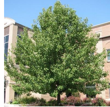
Pyrus spp. Ornamental Pear

Tolerates most soils, white flowers with strong scent. Light: Full Sun Height: 20' – 40' Spread: 15' – 30' Type: Deciduous Growth Rate: Medium/Fast Water Demand: Low/Medium