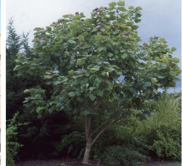
Catalpa x erubescens Purple Catalpa

Purple leaf color when young, tolerates most soil conditions. Light: Full Sun to Part Shade Height: 30' – 50' Spread: 20' – 40' Type: Deciduous Growth Rate: Medium/Fast Water Demand: Medium