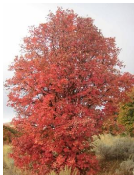
Acer grandidentatum Bigtooth Maple

Tolerates rocky soils and drought, colorful fall foliage. Light: 4 – 6 hours Height: 20' – 30' Spread: 15' – 25' Type: Native, Deciduous Growth Rate: Medium Water Demand: Xeric