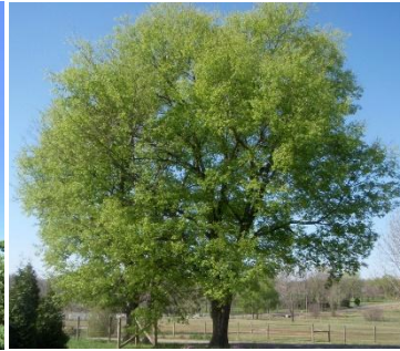
Celtis laevigata Sugarberry

Texture trunk, prefers clay soil, tolerates poor air quality. Light: Full Sun to Part Shade Height: 60' – 80' Spread: 60' – 80' Type: Deciduous Growth Rate: Fast Water Demand: Xeric/Low