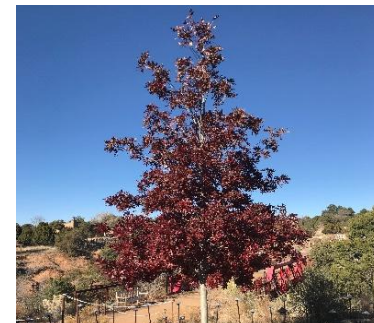
Quercus buckleyi Texas Red Oak

Bright red foliage in fall, sometimes multitrunked. Light: Full Sun Height: 25' – 40' Spread: 20' – 35' Type: Deciduous Growth Rate: Medium/Fast Water Demand: Xeric/Low