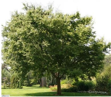
Zelkova serrata Japanese Zelkova

Tough, drought tolerant, requires early pruning. Light: Full Sun Height: 50' – 80' Spread: 50' – 80' Type: Deciduous Growth Rate: Medium Water Demand: Xeric/Low