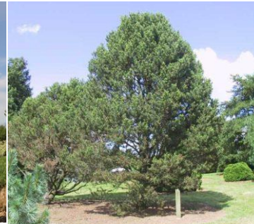
Pinus edulis Piñon Pine

Attracts wildlife, good screening, modest size. Light: Full Sun Height: 15' – 25' Spread: 12' – 25' Type: Native Evergreen Growth Rate: Slow Water Demand: Low