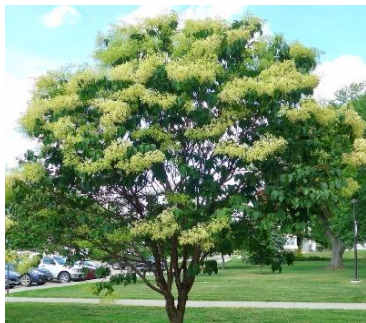
Syringa reticulata Japanese Tree Lilac

Prefers moist soil, unique flowers, sometimes shrub-like. Light: Full Sun to Part Shade Height: 20' – 30' Spread: 15' – 20' Type: Deciduous Growth Rate: Medium Water Demand: Low