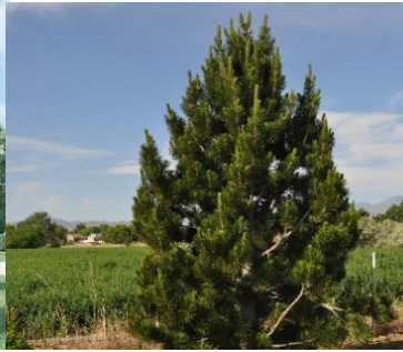
Pinus heldreichii Bosnian Pine

May not tolerate extreme heat/high winds, purple cones. Light: Full Sun Height: 30' – 40' Spread: 20' – 30' Type: Evergreen Growth Rate: Slow Water Demand: Low