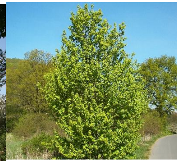
Acer campestre Hedge Maple

Frost hardy, for streets, yards, or hedges, easy to grow. Light: Full Sun to Part Shade Height: 25' – 35' Spread: 25' – 35' Type: Deciduous Growth Rate: Slow to Medium Water Demand: Medium