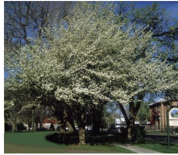
Crataegus submollis Northern Downy Hawthorn

Tolerates most soils, white flowers, pollinator friendly. Light: Full Sun to Part Shade Height: 20' – 30' Spread: 20' – 30' Type: Deciduous Growth Rate: Medium Water Demand: Low