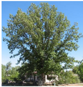
Quercus macrocarpa Bur Oak

Round, tolerant of heat and pollution. Light: 6+ hours direct Height: 60' – 80' Spread: 60' – 80' Type: Deciduous Growth Rate: Slow Water Demand: Xeric