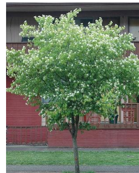
Crataegus ambigua Russian Hawthorn

White blossoms, horizontal branches, does well locally. Light: Full Sun Height: 18' – 25' Spread: 18' – 25' Type: Deciduous Growth Rate: Medium Water Demand: Xeric