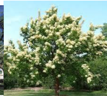
Syringa pekinensis Peking Tree Lilac

Often multi-stemmed, tolerates urban areas. Light: Full Sun to Part Shade Height: 15' – 20' Spread: 10' – 15' Type: Deciduous Growth Rate: Medium Water Demand: Xeric/Low