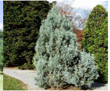
Juniperus osteosperma Utah Juniper

Very slow growing, hardy in drought and wind. Light: Full Sun to Part Shade Height: 15' – 20' Spread: 8' – 12' Type: Native Evergreen Growth Rate: Slow Water Demand: Xeric