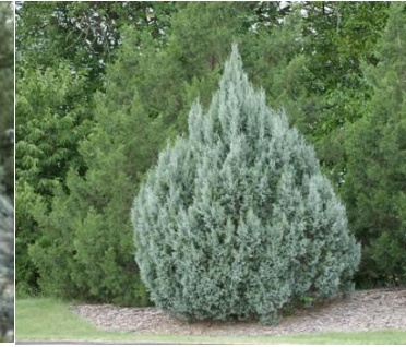
Juniperus scopulorum 'Gray Gleam'