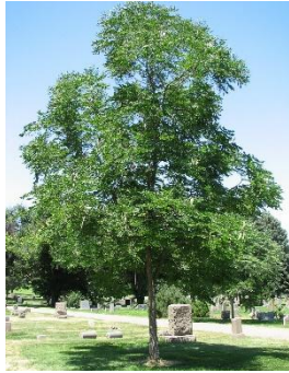
Gymnocladus dioica Kentucky Coffee Tree

Hardy, tolerates most soils, few pests, successful locally. Light: Full Sun Height: 60' – 80' Spread: 40' – 55' Type: Deciduous Growth Rate: Medium Water Demand: Xeric