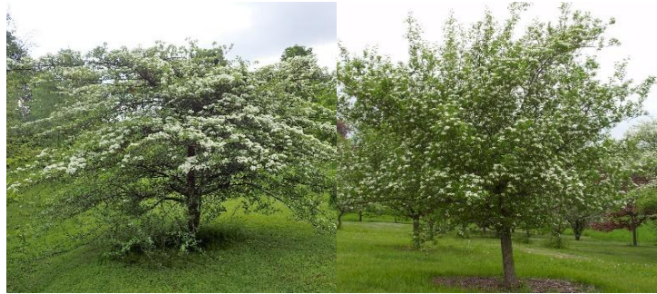
Crataegus crus-galli Thornless Cockspur Hawthorn

Notable horizontal structure, tolerates most soils, red fruit. Light: Full Sun Height: 15' – 20' Spread: 15' – 30' Type: Deciduous Growth Rate: Medium Water Demand: Xeric