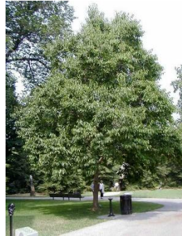
Eucommia ulmoides Hardy Rubber Tree

Glossy foliage, remains green in drought, minimal pruning. Light: Full Sun to Part Shade Height: 40' – 60' Spread: 30' – 50' Type: Deciduous Growth Rate: Medium Water Demand: Low