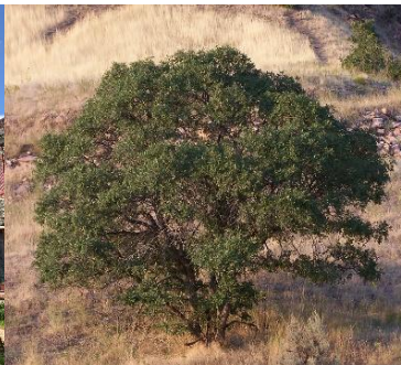
Quercus gambelii Gambel Oak

Tolerates rocky, alkaline soils. Spreads from root system. Light: Full Sun Height: 6' – 25' Spread: 10' – 12' + sprouting Type: Native, Deciduous Growth Rate: Medium Water Demand: Xeric