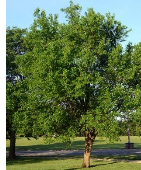
Maclura pomifera Osage Orange

Large inedible fruits, scaly and furrowed bark. Light: Full Sun Height: 35' – 55' Spread: 35' – 55' Type: Deciduous Growth Rate: Fast Water Demand: Xeric