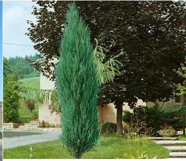
Juniperus scopulorum 'Skyrocket'