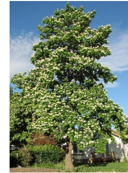
Catalpa speciosa Western Catalpa

Hardy, long fruit pods, compatible with xeriscaping. Light: Full Sun to Part Shade Height: 40' – 70' Spread: 20' – 50' Type: Deciduous Growth Rate: Medium / Fast Water Demand: Xeric / Low