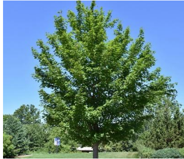
Acer miyabei 'Morton' State Street Maple

Tolerates urban conditions, good street tree. Light: Full Sun to Part Shade Height: 30' – 40' Spread: 30' – 40' Type: Deciduous Growth Rate: Moderate Water Demand: Medium