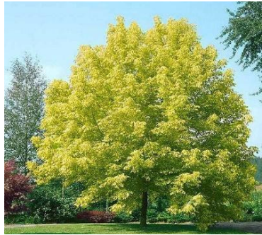
Acer negundo 'Sensation' Box Elder, Sensation

Hardy, mid-size shade tree, susceptible to storm damage. Light: Full Sun Height: 25' – 80' Spread: 30' – 50' Type: Native, Deciduous Growth Rate: Fast Water Demand: Low/Medium