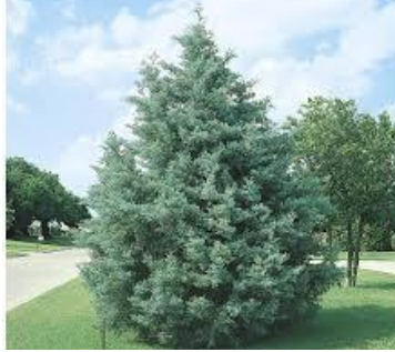
Cupressus arizonica Arizona Cypress

Juniper-like foliage, tolerates heat and most soil types. Light: Full Sun Height: 30' – 40' Spread: 15' – 25' Type: Deciduous Growth Rate: Medium Water Demand: Xeric