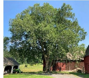
Ulmus spp. Hybrid Elm

Tough, select variety resistant to Dutch Elm Disease. Light: Full Sun to Part Shade Height: 30' – 60' Spread: 20' – 40' Type: Deciduous Growth Rate: Fast Water Demand: Xeric/Low