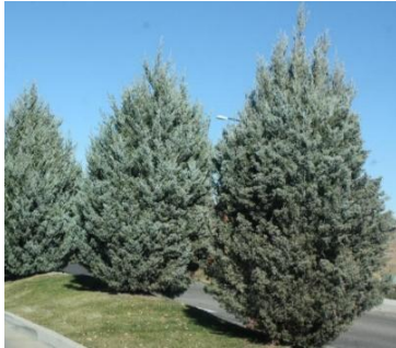
Juniperus scopulorum 'Wichita Blue'