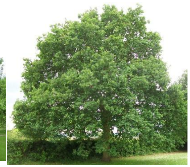
Quercus robur English Oak

Tolerates most soils, low maintenance, hardy. Light: Full Sun Height: 40' – 60' Spread: 40' – 60' Type: Deciduous Growth Rate: Medium Water Demand: Medium