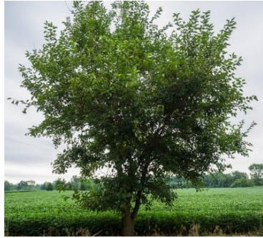
Morus alba cultivars White Mulberry, Fruitless

Hardy, with dense canopy, in fruiting and fruitless varieties. Light: Full Sun to Part Shade Height: 30' – 50' Spread: 30' – 50' Type: Deciduous Growth Rate: Fast Water Demand: Low