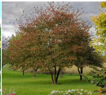
Crataegus phaenopyrum Washington Hawthorn

Red fruit, bright blossoms, tolerates most soils. Light: Full Sun Height: 25' – 30' Spread: 25' – 30' Type: Deciduous Growth Rate: Medium Water Demand: Low