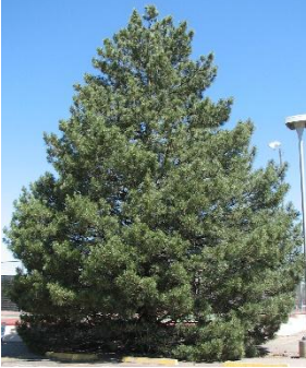
Pinus nigra Austrian Pine

Hardy, good for windbreaks, tolerates most soils. Light: 6+ hours direct Height: 40' – 60' Spread: 20' – 40' Type: Evergreen Growth Rate: Medium / Fast Water Demand: Low