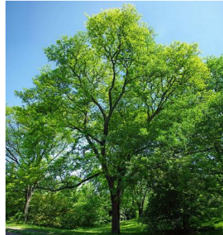
Gledistia triacanthos inermis Honeylocust

Demonstrated local success, hardy under most conditions. Light: Full Sun Height: 60' – 80' Spread: 60' – 80' Type: Deciduous Growth Rate: Fast Water Demand: Xeric