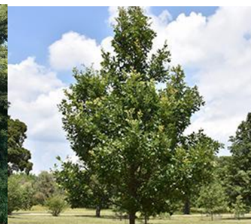
Quercus x maxei Colorado Foothills Oak

Hardier than most oaks, drought tolerant, shrublike. Light: Full Height: 35' Spread: 30' Type: Native Deciduous Growth Rate: Slow Water Demand: Xeric