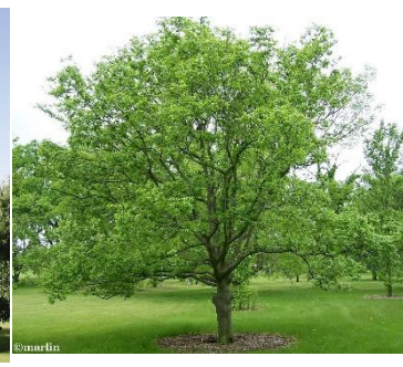
Celtis occidentalis Common Hackberry

Tolerates most soils, easily transplanted. Light: Full Sun Height: 30' – 60' Spread: 40' – 60' Type: Deciduous Growth Rate: Medium/Fast Water Demand: Xeric