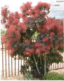
Cotinus obovatus American Smoketree

Showy ornamental, tolerates a wide of moisture levels. Light: Full Sun to Part Shade Height: 15' – 20' Spread: 10 – 15' Type: Deciduous Growth Rate: Medium Water Demand: Low