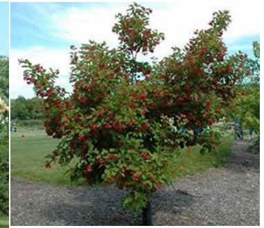
Acer tataricum Tatarian Maple

Sometimes shrub-like, upright, winged seeds. Light: Full Sun Height: 15' – 20' Spread: 15' – 20' Type: Deciduous Growth Rate: Fast Water Demand: Xeric / Low