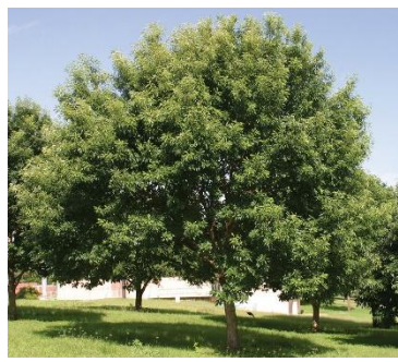
Quercus muehlenbergii Chinkapin Oak

Tolerates most soils, attracts many wildlife species. Light: Full Sun Height: 45' – 60' Spread: 50' – 70' Type: Deciduous Growth Rate: Medium Water Demand: Low/Medium