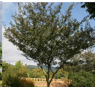
Crataegus viridis cultivars Green Hawthorn cultivars

Dense, easy to grow, disease-resistant, thorns. Light: Full Sun Height: 20' – 35' Spread: 20' – 35' Type: Deciduous Growth Rate: Medium Water Demand: Low