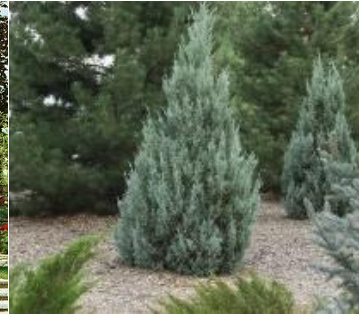
Juniperus scopulorum 'Cologreen'