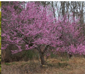
Cercis canadensis Redbud

Pink spring flowers, short trunk, ornamental. Light: Full Sun to Part Shade Height: 15' – 25' Spread: 15' – 30' Type: Deciduous Growth Rate: Medium Water Demand: Medium